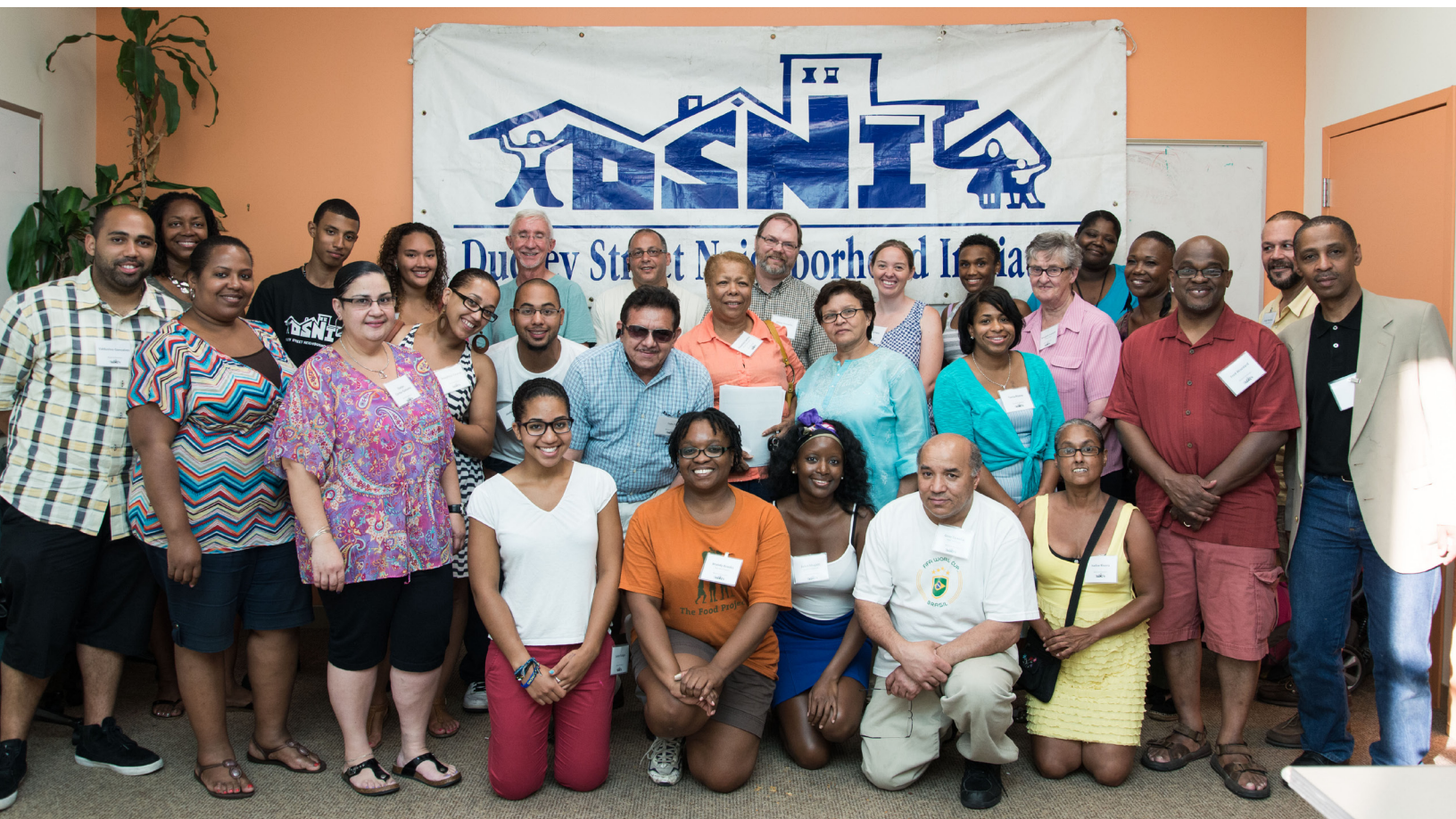
2013-2015 DSNI Board of Directors

A.C. Ratschesky Foundation ArtPlace America Barr Foundation Berkman Family Fund Boston After-School & Beyond The Boston Foundation Ford Foundation Hyams Foundation Klarman Family Foundation Liberty Mutual Foundation Ludcke Foundation United Way of Mass Bay U.S. Department of Education