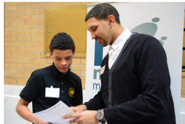
left: DSNi mentoring program, Stronger Leaders Brigher Future

"...having a mentor has changed my life in many ways, I am able to solve many issues I have with school and everyday life. She has helped me to find my self-worth, love myself and discover who I am as a person." -9th Grade Mentee