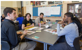
above: DSNI Community Summit

Fourteen of the 20 Boston Promise Initiative Organizers hired to conduct the neighborhood survey were residents of the Dudley Village Campus. Over $35,000 was invested in jobs and resident leadership.