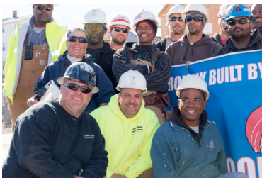
left: Choice Neighborhoods construction workers