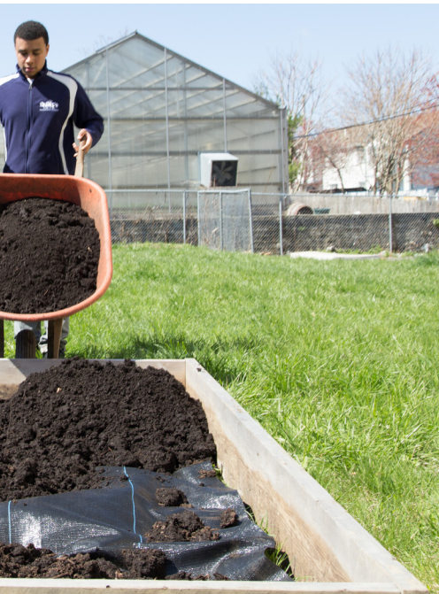
above: DSNi and The Food Project building raised-bed gardens

65 Youth Organizers, Peer Leaders and Supervisors hosted 20 different interactive events during the year.