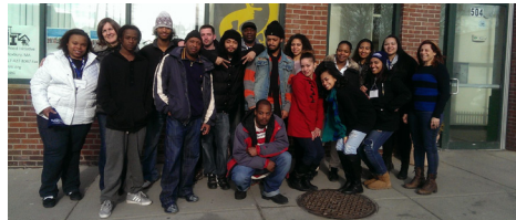
left: BPI Survey Team