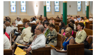
above: 2013 DSNI Annual Meeting