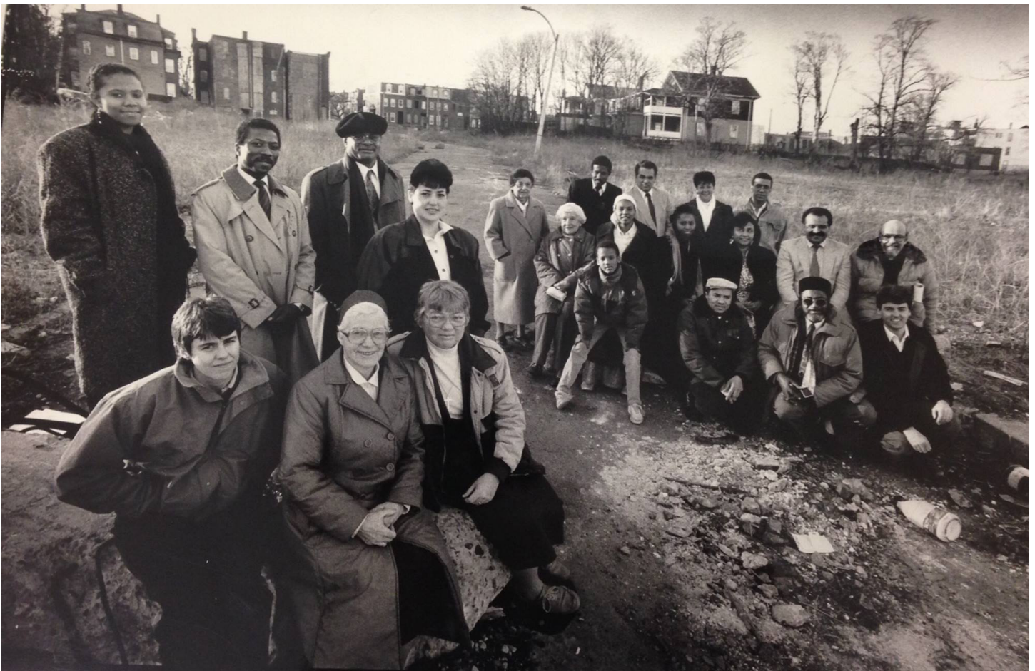
1990 DSNI board and staff.

Through our Board structure, residents lead an effort that includes all neighborhood stakeholders in a democratically-elected, community accountable process. Together, we have created greater civic participation, economic opportunity, community connections, and opportunities for youth. We have built community across our diversity—of language, race & ethnicity, age. We have invested in our young people and the youth in turn have invested in the community.